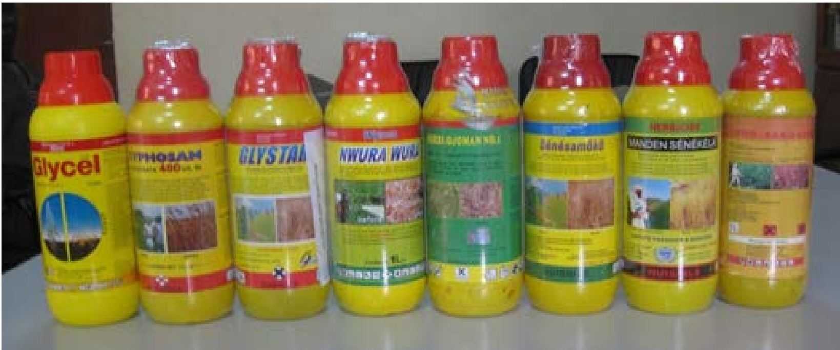
Figure 4. The Red Berets