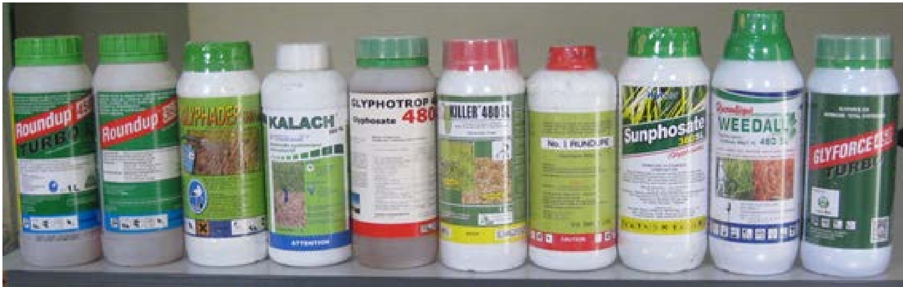
Figure 3. Roundup and imitations