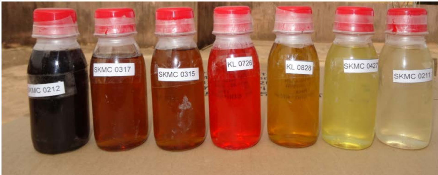
Figure 5. Glyphosate samples: same active ingredient, differing contents